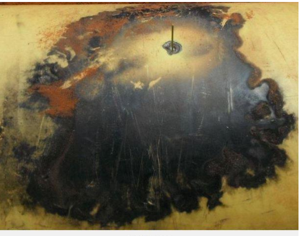
Defect as found

The non-leak lightning strikes were discovered through in-line inspection where strange defect indications were investigated and revealed fused craters in the pipe wall. There may be more of these that have not yet been discovered. Two of the lightning incidents were associated with power lines, where the lightning initially struck the wires then ran down a stay wire that passed close to the pipeline. So there is an obvious way to avoid that. But apart from that situation there appears to be no mitigation available for random lightning strikes on a buried pipeline."